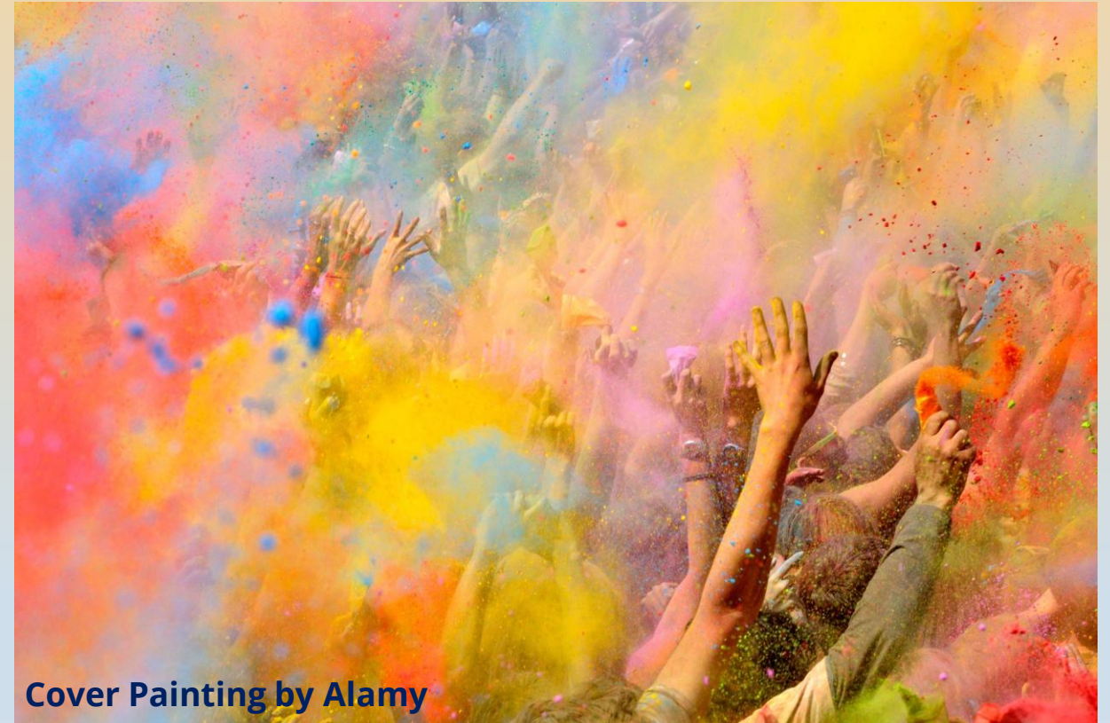
Cover Painting by Alamy

Water, Sanitation And Hygiene Month Sanskriti Theme: HOLI